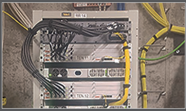
VoltServer's DAS equipment in tunnel using Remeë's rugged PowerPipe™ cable.