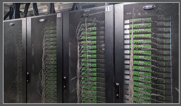
VoltServer equipment installed in stations.